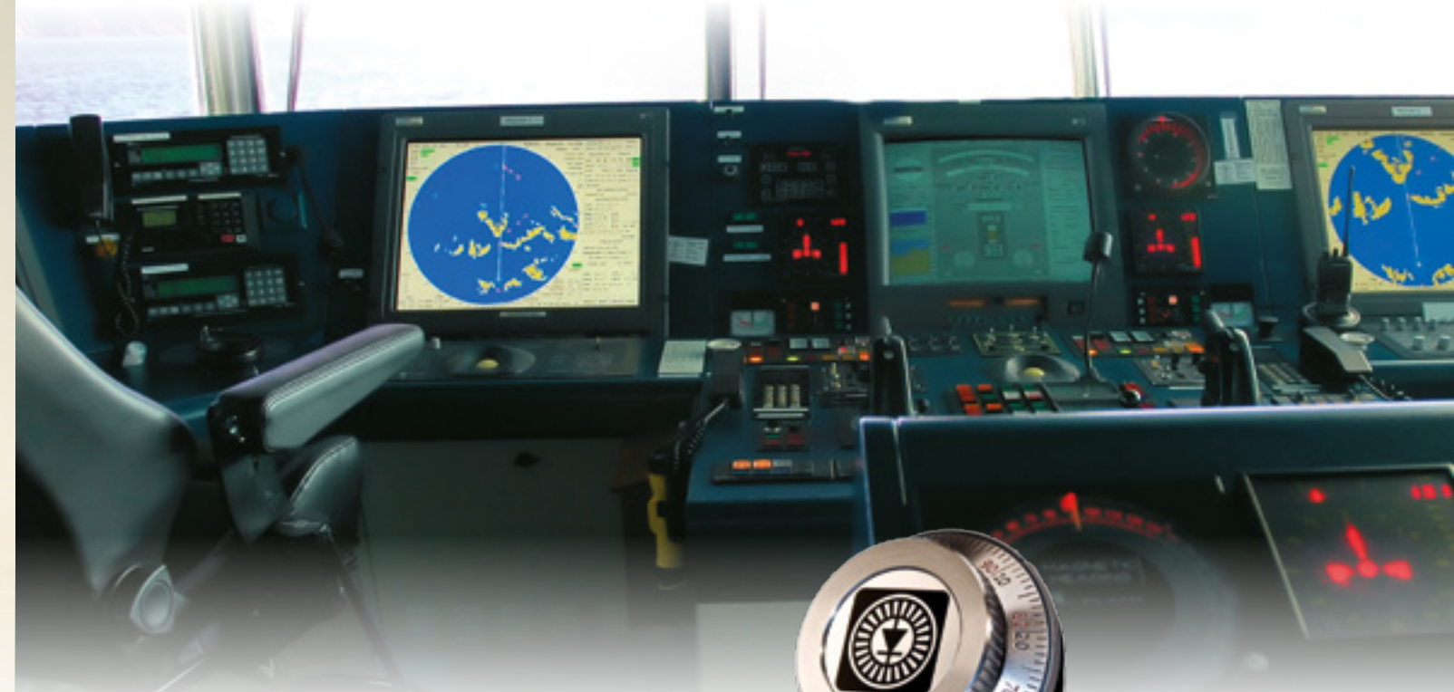
Panels on rig control house

Rig Controls and Commercial Painting Enclosures