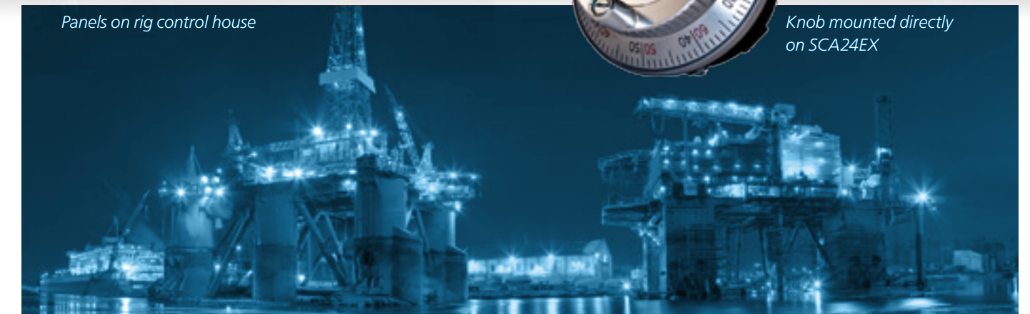
Knob mounted directly on SCA24EX